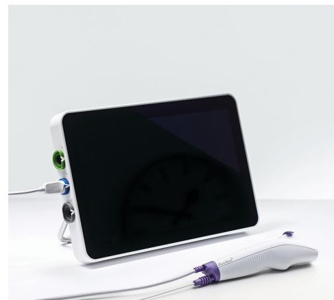
Ambu® aScope™ 4 RhinoLaryngo Slim and Ambu® aView™ 2 Advance

** aScope 4 RhinoLaryngo Slim is not available for sale in all countries. Please contact your local Ambu sales representative.